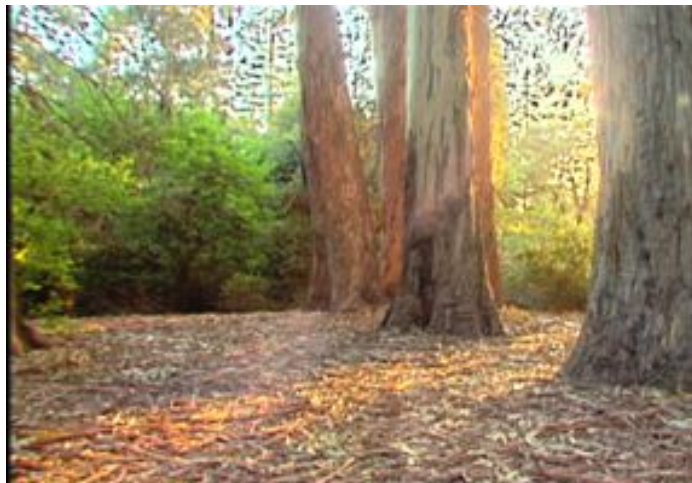
Grow image with c = 0.1