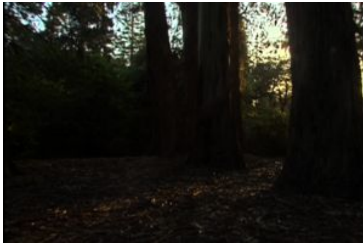
Grow image with c = 2.0