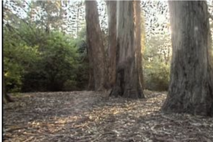
Grow image with c = 0.25